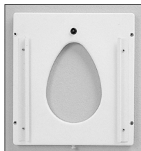
SA154 Seat Assembly