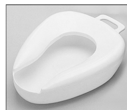
No. 640 Bed Pan